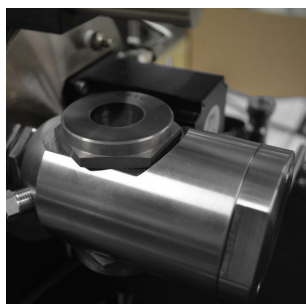
M6550 HPHT Pressure Vessel