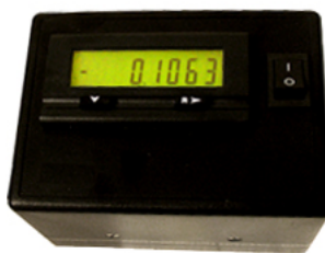
M6550 LCD Numerical Display