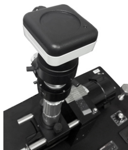
M6550 Optional Digital Camera with PC Software